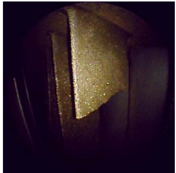
This photograph shows another S-1 stator vane failure.