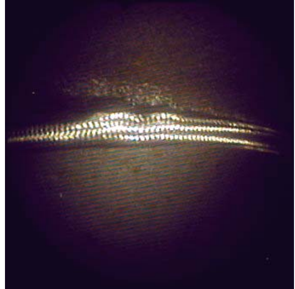
This photograph shows a budge in one of the lift oil lines.